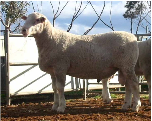
Anden 50190 (Retaining ram for stud use)

All sheep are presented with across flock EBVS as at August 2008, for some assistance in selecting stud sheep across all of the Australian White Suffolk Flocks using the new Carcase Plus Index.