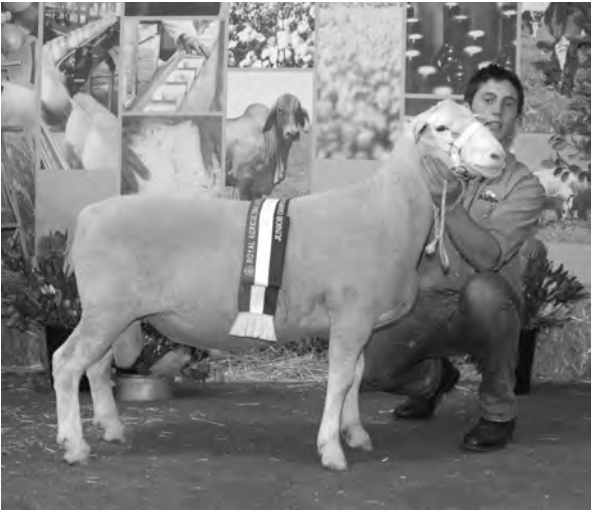
Anden 10162 Junior Champion Ram Royal Adelaide 2011.