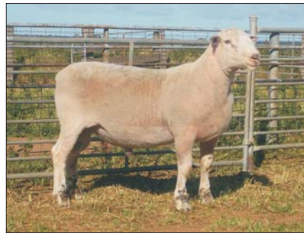
Anden 80269 (Retained for Stud use) Sire - Lambpro 6423

Inspection of Stock on Sale Day from 11.00 a.m. BBQ Lunch provided. Stud Sale commencing at 2.00 p.m. with Flock Rams to follow.